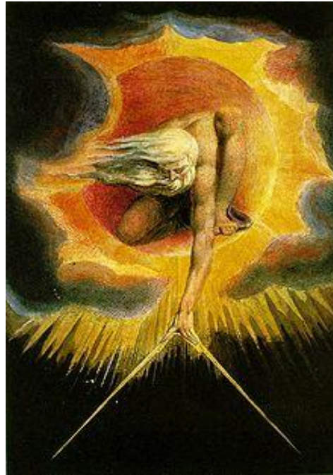
Figure 1. The Ancient of Days 3

1990; Lloyd, 2006; Rhodes, 2001; Schmidhuber, 1997; Svozil, 2005; Tegmark, 2007; Wolfram, 2002). Some common responses to the idea are detailed in Appendix A.