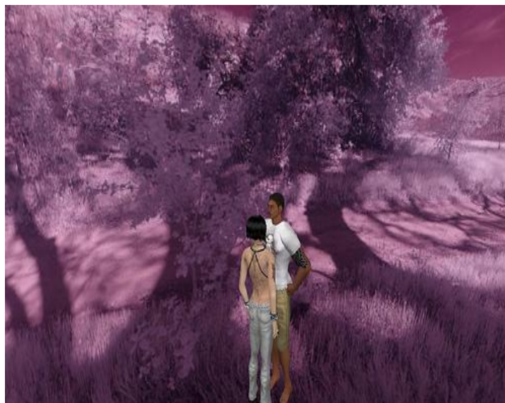
Figure 3. A virtual reality game

So space is not the screen the virtual reality appears on, e.g. the Figure 3 avatars are just pixels, but so is their background. As an avatar moves through the forest, no fixed node-pixel mapping is required, as any screen node can process any pixel, whether of avatar or background. Programmers "move" an avatar image through a forest by shifting all its pixels equally relative to the background, but often prefer to "bit-shift" the background behind the image, leaving the avatar centre screen as he/she "moves" through the forest. A later paper attributes relativistic frames of reference to this. Only for each processing cycle instance does a space pixel "point" necessarily map to one screen grid node. Recall that the grid proposed is not space, time, or space-time, but what creates them .