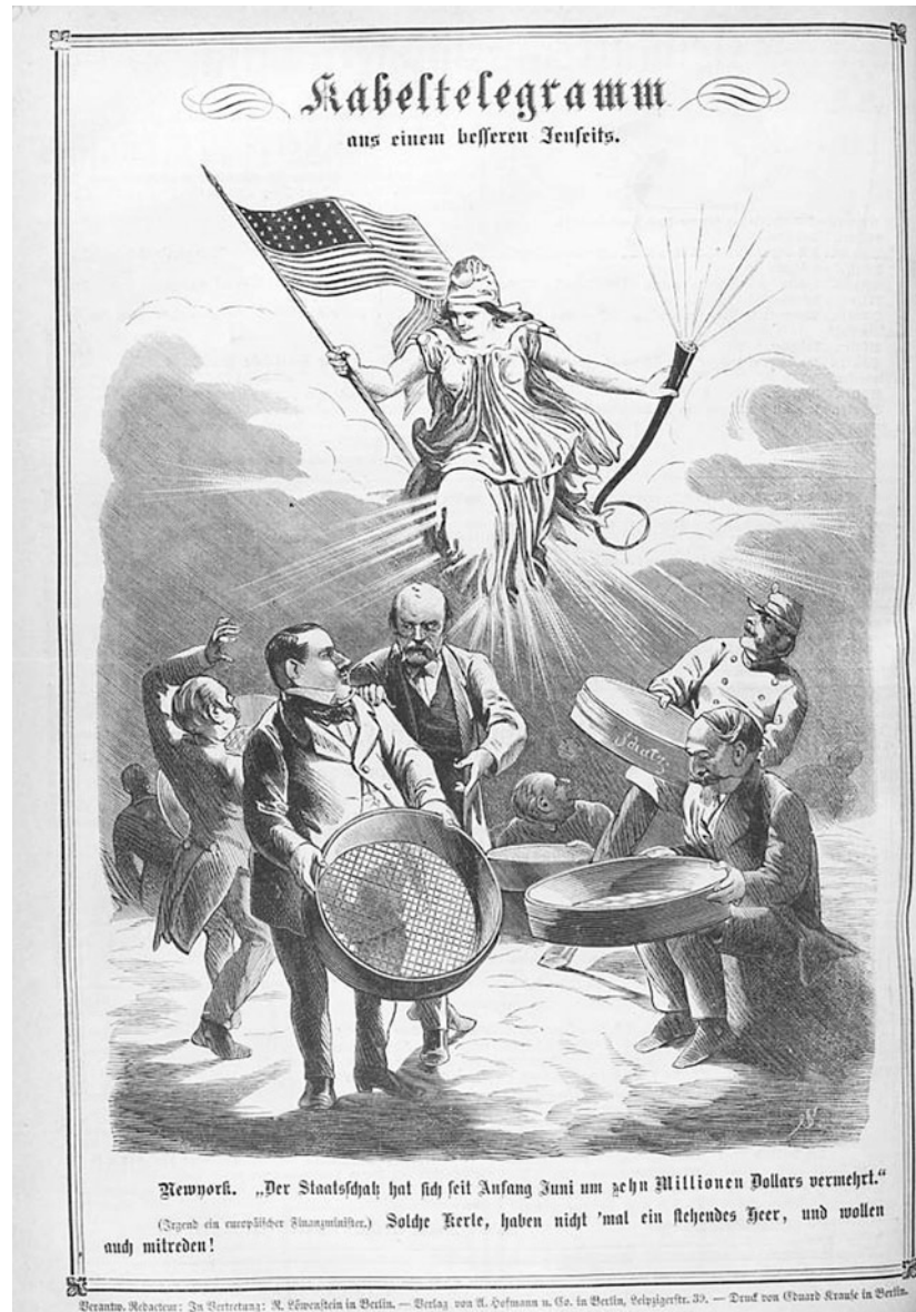
Fig. 1. “Cable telegram from a better Beyond.” Kladderadatsch , 32:29–30 (27 June 1869): 120. The caption beneath reads: “New York. ‘The treasury has grown by more than ten million dollars since the beginning of June.’ (Some European Finance Minister [says of the Americans,]) ‘Such fellows don’t even have a standing army and want to speak up anyway.’”