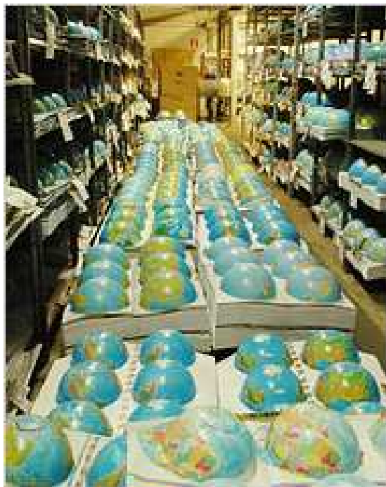
Figure 1 Visualizing the ‘Superpopulation’ Assumption

Manufacturing Globes in Italy. The assumption that we can treat the world as part of a ‘superpopulation’ is something like the idea that endless worlds roll off an assembly line, usually with the additional assumption of indeterminism - that each world is different from the others. 3