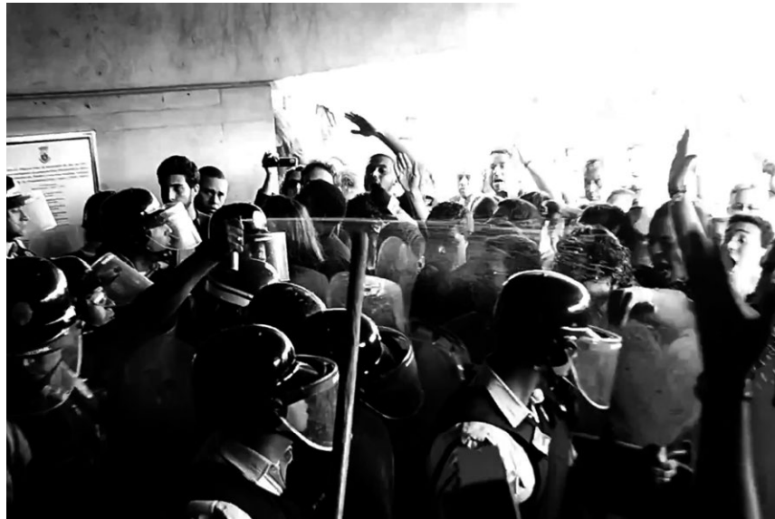
FIGURE 4. Police spray protestors with a lachrymatory agent. Still frame, captured from A Partir de Agora—As jornadas de junho no Brasil .

small groups whose actions were used to justify the police use of force. Some were protestors enacting Black Bloc tactics of confrontation and property destruction, whereas others were belligerent, and these included undercover officers carrying out false flag operations (Gutterres 2014, 904–5). 8