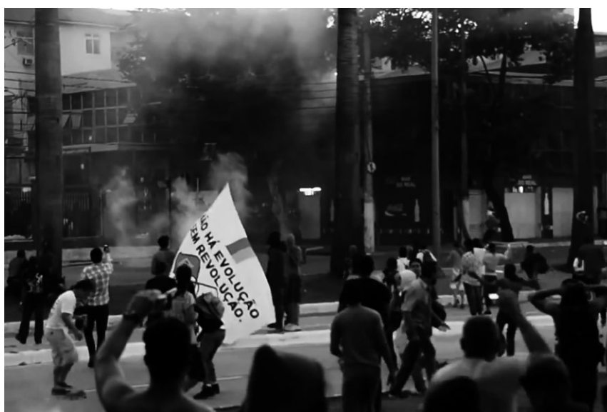
FIGURE 2. Protestors facing off against police. One carries a banner “There is no evolution without revolution,” and several are filming with their cell phones. Still frame, captured from A Partir de Agora—As jornadas de junho no Brasil . Carlos Pronzato CC BY 3.0 BR.

The protests in June and July 2013 took many people by surprise for their size, their energy, and the fact that they happened at all (Figure 2). That they were not sponsored by a political party, the labor unions, or the church, as well as the way that the invitations to participate were