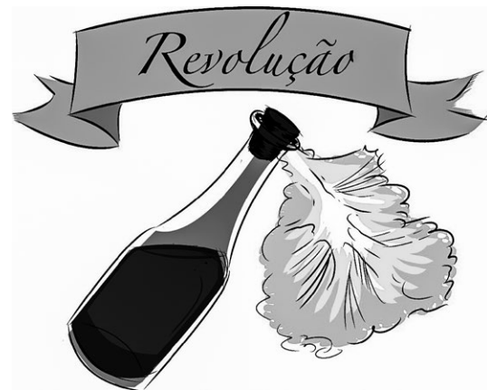
FIGURE 3.

Designers, photographers, and other artists rapidly captioned photos and images, developing an aesthetic with references to other social movements, from Occupy to Gezi. Their Tumblrs offered meme-ready graph-