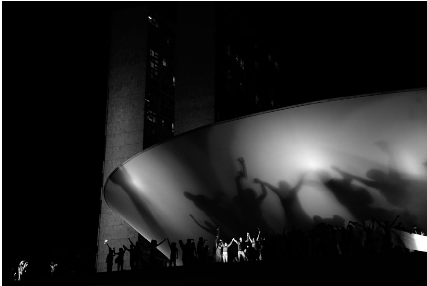
FIGURE 6. Protestors gather atop the National Congress building in Brasilia.

aftermath demonstrated that new media technologies are part of the affective way that power operates now. The transformative potential of the protests, perceived by the ninjas, among others, and advanced through their aesthetic politics, effectively catalyzed new actors across the political spectrum. The new media technologies played as much a role in the polarization and ideological hardening of movements after 2013 as in their earlier buildup, however, with the filter bubble of Facebook and the messaging service WhatsApp (acquired by Facebook in 2014) facilitating a highly insular sociality.