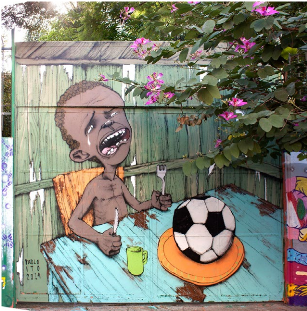
FIGURE 1. "evento da pompéia 2014." Art and photo by Paulo Ito CC BY-NC-ND 2.0.

service of a transformative politics. The awakening and empowerment this facilitated among Brazilians were not inherently progressive. Mixed in with demands for transportation, education, and reform of the political process were calls for military intervention and even the return of the dictatorship. Yet this analysis suggests that the activists took up new media technologies as a kind of equipment that could generate new relationships and subjectivities, and thereby access to intentionally undetermined futures.