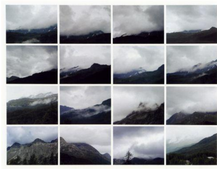
Image (above) - Gerhard Richter, Sils Maria, 2006, Atlas , Sheet 769 ...