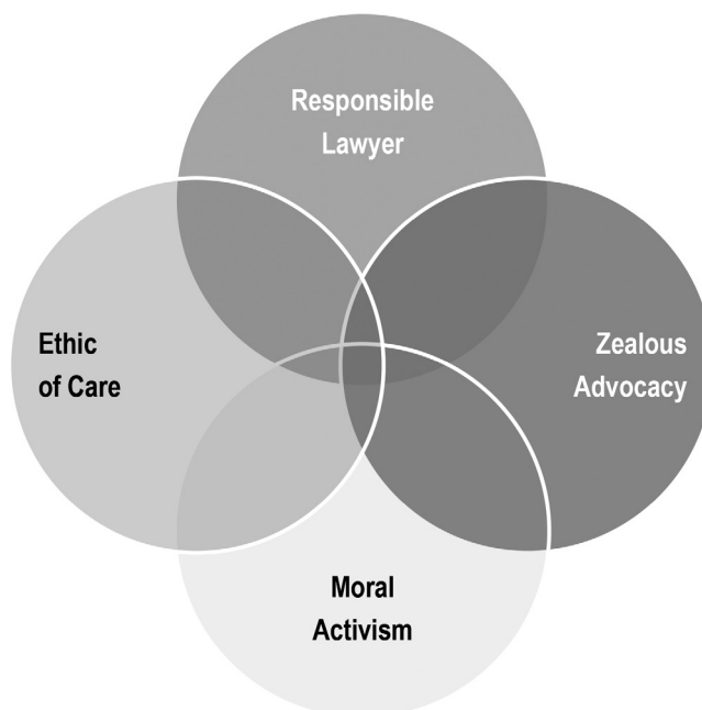
Figure 2: Interrelating Legal Ethical Types

Lawyers who are able to consciously determine that one of these four ethical approaches (or even a combination of more than one approach) most closely meets their own preferences are, regardless of that choice, likely to be better positioned to deal with the complexities of the therapeutic approach. Although