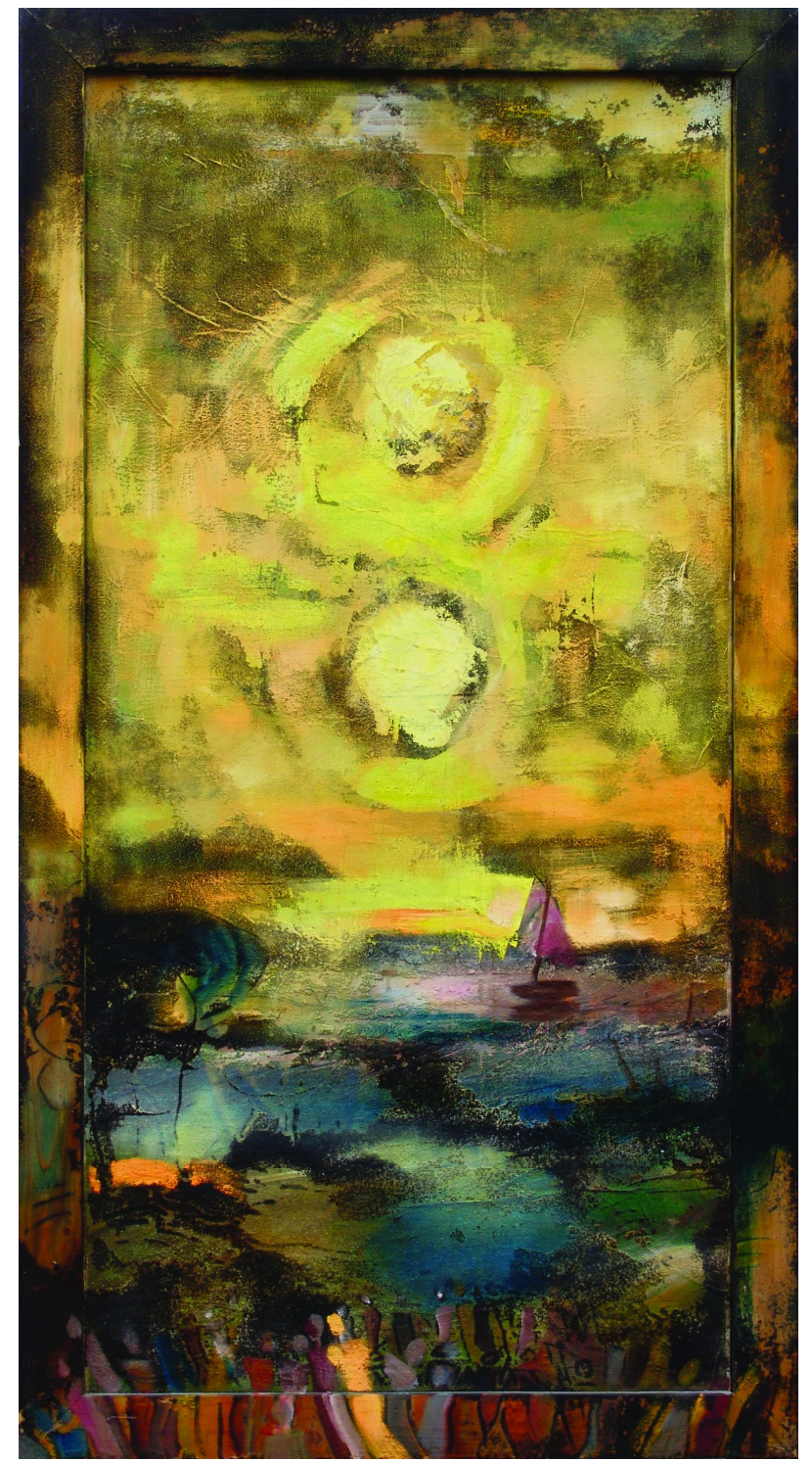
Octavian Cosman , Double Sun – Mirage , 154 x 83 cm, oil on canvas and wood, 1997