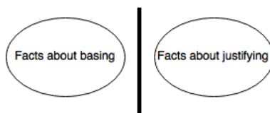
Figure 1. Spectatorial Conception

The Spectatorial Conception of the basing relation, in short, places a metaphysical “wedge” between (i) the basing relation, and (ii) the activity of justifying, by regarding “facts that determine basing relations [as] not directly determined by ... explicit deliberative or justificatory activity.” The simple picture is: