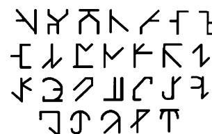
Fig. 1 Pseudoletters used in experiments 1 and 2

T2 was presented at one of three lags after T1: 100, 300, or 900 ms, i.e., lags 1, 3, and 9, respectively. The lag was selected randomly on each trial, with the constraint that there was an equal number of trials per lag. Pseudoletter distractors continued to be presented during the inter-target lag. The RSVP stream ended with a 7-ms presentation of T2. The sequence of events on any given trial is illustrated in the left-hand panel of Fig. 2 . In the present context, the