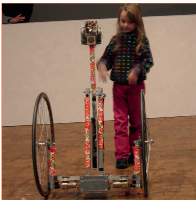
Figure 1. Petit Mal . © Simon Penny.

In this context, he argues how Cybernetics assumes in fact an ontology that, contrary to the reductionist approach, involves a certain degree of unknowability, as it "tries to address the problematic of