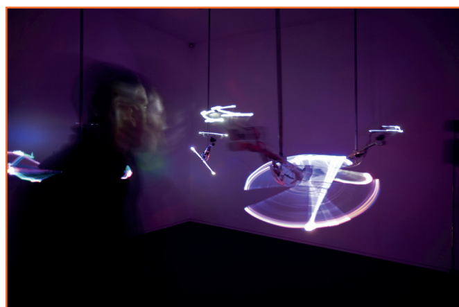
Figure 3. Performative ecologies. © Ruairi Glynn.

A successful example of such pieces is Ruairi Glynn's Performative Ecologies (Glynn, 2008), a series of robots that learn how to best attract the gaze of the visitors to the installation space by 'dancing' in front of them. As they perform their moves, they calculate (through facial recognition) how much of the attention of a visitor these moves are capable of attracting. Then, using genetic algorithms, the individual robots will create new dance moves based on those that were successful within the group. With this, eventually the robots should be capable of attracting more and more of the users' attention as they learn over time to do so. The new behaviors that the robots learn and perform, and that were not pre-designed by the artist, can be regarded as a case of emergence – particularly, of combinatoric emergence according to Cariani's categorization (Soler-Adillon, 2015).