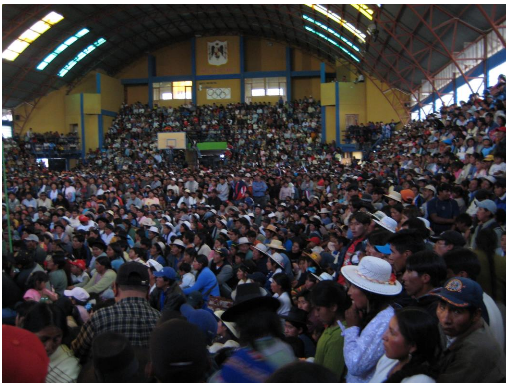
Fig. 4. Audience in Coliseo Minero in Potosí during a charangeada festival, 2007.

produce a perfection impossible in the real world” (2003: 104). 33 Even if from Tim Ingold’s ‘dwelling’ perspective “the landscape is not an external background or platform for life” (2000: 54), in the sphere of Andean music video production a “background” to music and dance is precisely how such landscapes were presented and produced. We might also wonder how much people’s perception of landscape as “a topologically ordered network of places” (Ingold 2000: 54) holds true in the case of music video, where it is the music (not people’s “tasksapes”) that connects and brings a sense of continuity to the diverse landscape fragments. Indeed, it is striking how syncretism —Michel Chion’s (2000: 205) term for our universal capacity to perceive a union between simultaneous sonic and visual events—naturalises relations between images and music, a point made especially clear when the sound of a music video is muted.