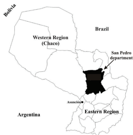
FIGURE 3: Map.

residual spraying (52%, 241/463), treated dog collars (31%, 142/463), and insecticide treated bed nets (28%, 130/463) (Table 4).