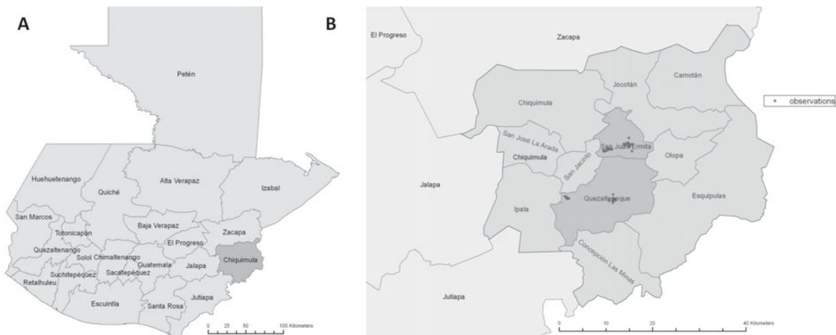
Fig. 1. Maps of Guatemala, showing the department of Chiquimula (A) and the sampled municipalities in Chiquimula (B), San Juan Ermita and Quezaltepeque, with the sample houses marked by circles (black).

1 Categorized by visual inspection (interviewer). Organized=belongings tidied away or intentionally positioned. Disorganized=no obvious intentional positioning of belongings, with items such as food, clothing or firewood, on the floor providing potential triatomine refuges. Light=natural light in bedroom, Dark=no natural light in bed room.