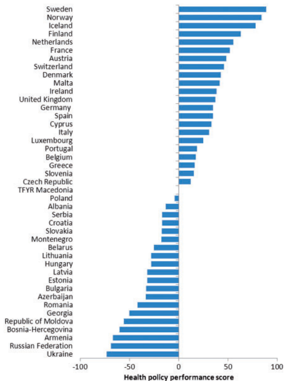
Figure 1 Summary scores for health policy performance, by country

As a result, the incidence of HIV infections is high in Ukraine, Estonia and Moldova.