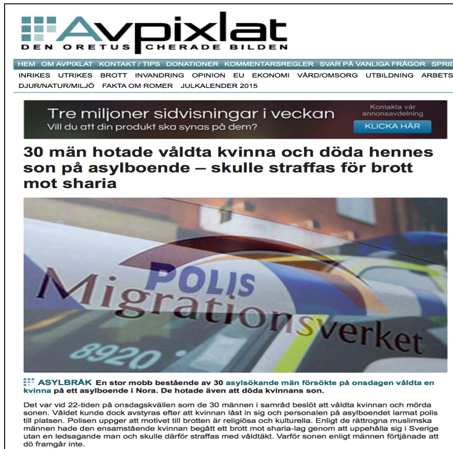
Figure 3: Avpixlat Post of 28/11/2015 5

(similarly to the above Austrian item). We hence encounter references to the alleged: migrant criminality, violation of women's rights, asylum-seeking (via reference to 'asylboende') and, last but not least, to the Islam-related motivations behind the violence (via the reference to the 'break of Sharia' or brott mot sharia ).