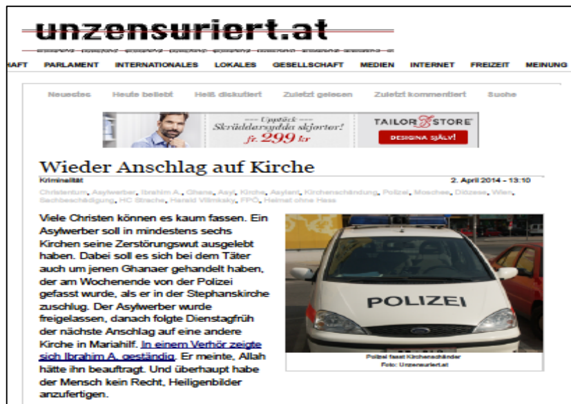
Figure 2: Unzensuriert.at Post of 02/04/2014 4

safety and institutions. However, it is already in the subtitle of the main image reading 'Police catches church-vandal' ( Polizei fasst Kirchenschänder ) where the gradual shift towards the uncivil frame occurs, initially by means of refocussing the attention from public force (police) to the individualised 'vandal'. In a similar vein, the list of keywords placed immediately under the main heading (incl. Christianity, Asylum-Seeker, Ibrahim A., Ghana, Asylum, Church, etc.) suggests that this text should not be perceived as an isolated item but that it links very closely to wider Austrian discourses esp. on immigration, religious differences etc 3 .