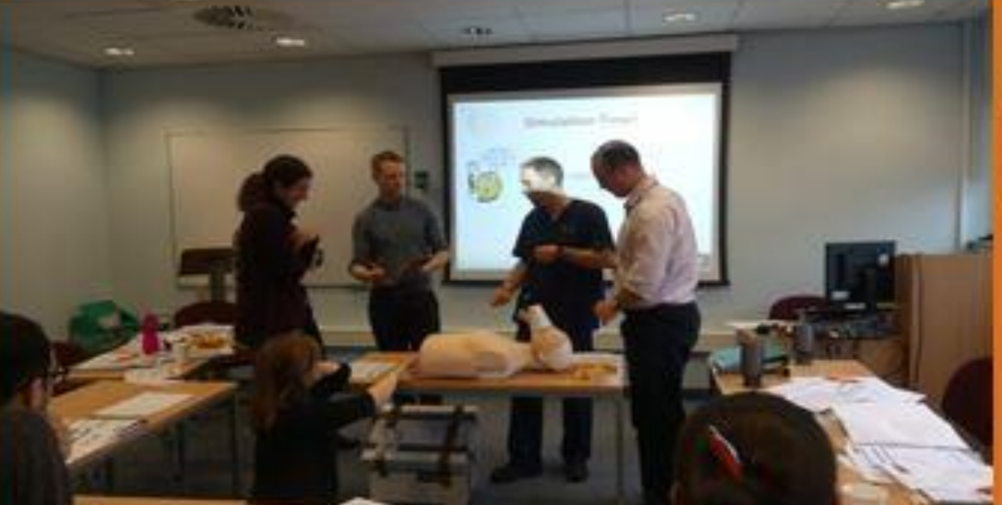
Simulation practice during site initiation training in The Children's Hospital, Cardiff