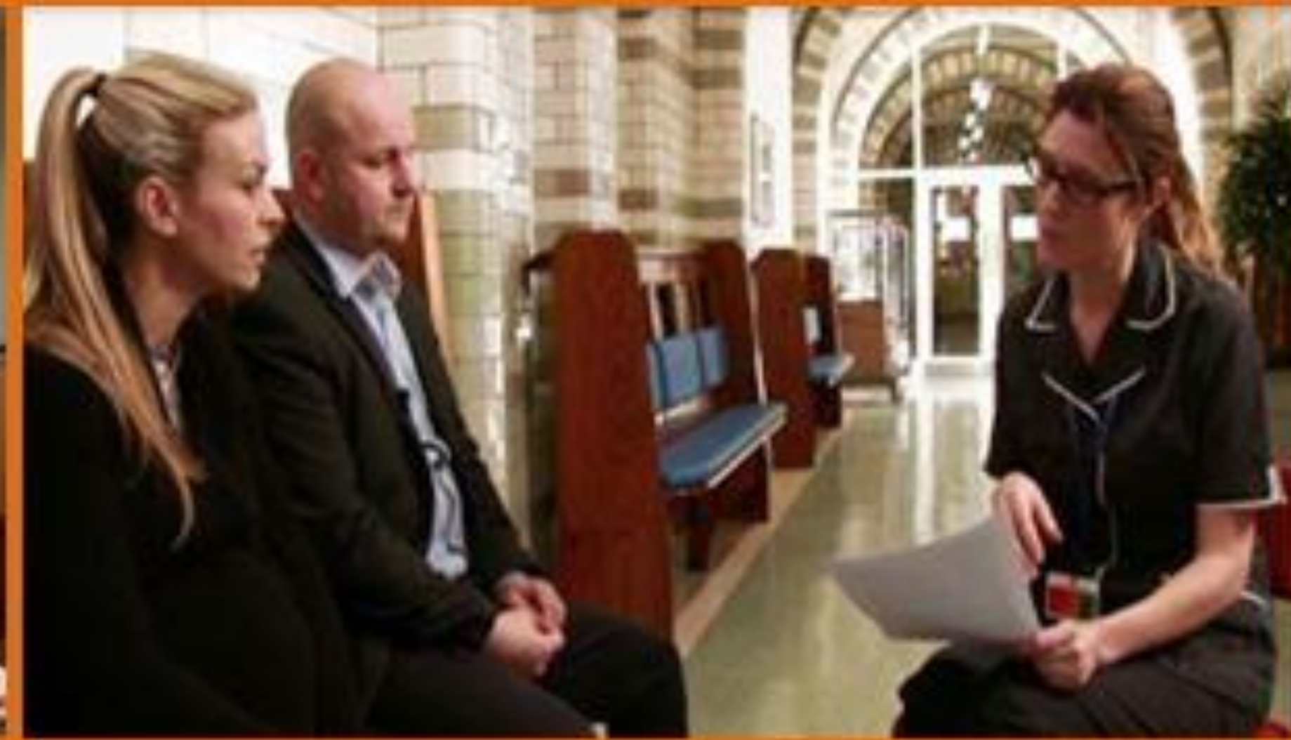
Recruitment conversation training video for staff taking consent, filmed at The University of Liverpool