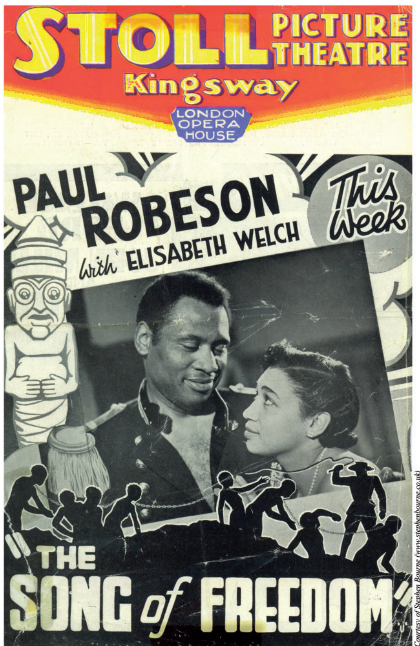
Fig. 3. Film Poster, 'The Song of Freedom' (1936).