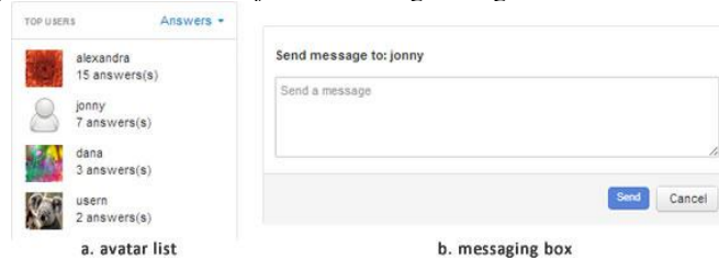
Figure 4. a. Avatar list of recommended learning peers to send messages to; b. the resulting pop-up messaging box

The rating for (7), sending a message , was, whilst high, the second lowest (mean = 3.9) with regards to its ease of use . The possible reason for this is the current notification mechanism for new messages. More specifically, if a student was on the messaging page, on receiving a new message a notification button, like 'You have 2 new messages', would show up. Clicking on that button would refresh the webpage with an AJAX response and show the received messages on the top of the message list. However, if the students were on other webpages, they wouldn't know whether they received any new messages. Therefore, the students might have had no idea when and how to start messaging. Additionally, whilst most of the webpages in the Topolor system provide at least one tool for sending messages to other students, such as 1) a new message box (Figure 2b) and 2) an avatar list of the recommended learning peers (Figure 4a) that could be clicked on, and then a messaging box (Figure 4b) would pop-up. There are still other webpages that did not provide such tools, potentially affecting the results on the ease of use of sending messages.