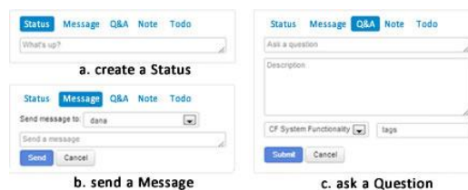
Figure 2. Social interaction toolset: (a) learning status creation tool; (b) messaging tool; (c) Q&amp;A tool

This paper focuses on three social interaction tools. The status tool (Figure 2a) is used to share learning statuses. Learners can favorite and comment on each other's posted learning statuses; the messaging tool (Figure 2b) is used to send private messages to others; and the Q&A tool (Figure 2c) is used to ask and answer questions. Learners can also use Q&A tool for discussions.