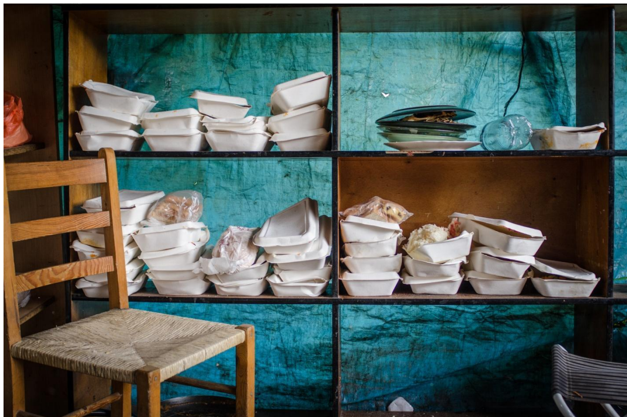
Figure 3: Portions of food salvaged from the Jules Ferry centre stored unsafely inside makeshift shelters without adequate refrigeration (Sub-camp 3)

Residents of the camp were ostensibly entitled to one meal a day free-of-charge from the central kitchens at the adjacent state-sponsored distribution centre. However, evidence from NGOs in the camp suggested that at the time of the study, the available free food would only cover approximately two-thirds of the population of the camp, and this assertion was supported by evidence in group-interviews which described a shortage of food. Hunger was reported as being commonly experienced by residents in each of the eleven sites. In addition, there were frequent reports in group-interviews of constipation owing to the lack of fruit and vegetables and a reliance on white bread as a staple. Where possible, this single meal was partially kept and supplemented later that day or the next, with donated food, most commonly pasta or tinned beans (Figure 3). The inadequate levels of sustenance available from the French state in this instance is among the most fundamental forms of biopolitical othering (Foucault 1978); reducing refugees to a state of hunger in this way becomes a political device that reproduces refugee biologies as lives that can be ‘wasted’ (Bauman 2004).