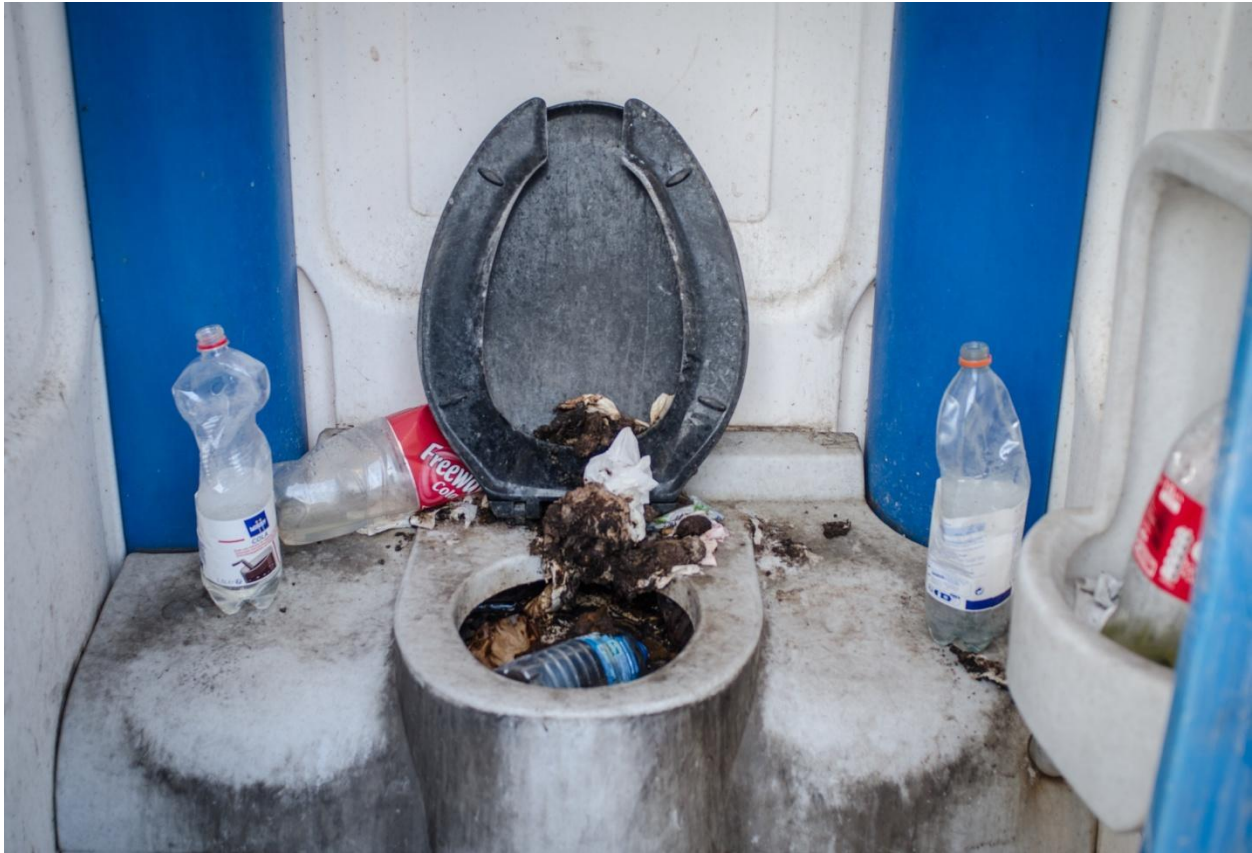
Figure 6: A typical view of the inside of one of the overused toilets. There were insufficient numbers of flush-toilets to serve the camp population, failing to meet ‘Sphere’ standards.

Toilet facilities were inadequate in number and condition, with 40 toilets available in the entire camp, and many of those found to be heavily soiled or full and unusable (Figure 6). The ratio of toilets to residents was one per 75 residents; the UNHCR guidance for refugee camps recommends one toilet per family unit (6-10 people) or one per 20 residents in emergency situations (UNHCR 2007, 553). Residents frequently reported the toilets to be in a dirty condition, and this was verified by field observations as well as during interviews: