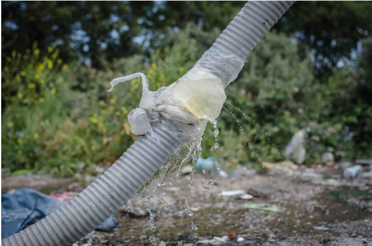
Figure 4: A leaking drinking water pipe in the Calais camp, presenting a risk of supply contamination. One water tap tested positive for pathogenic bacteria indicative of faecal matter.

Residents were generally aware of basic food safety controls, such as handwashing, equipment cleaning, separation of raw and ready to eat foods, cold storage of high-risk foods and the need to cook and reheat food thoroughly. However, the French state's decision not to intervene with the provision of such facilities made adhering to many of these measures impossible. The inability to wash foods such as vegetables effectively presents a risk of E.coli contamination from soil on produce; ingestion of E.coli 0157 can cause symptoms including severe diarrhoea (Swerdlow et al 1992), and exposure even at low doses, can be fatal or lead to life-changing illness (Food Standards Agency 2014).