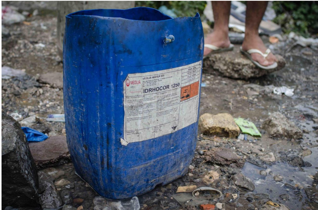
Figure 5: A container formally used to store a corrosive chemical (Methyl-1H-benzotriazole) is used by a group of refugees to store and transport potable water.

2009). A high incidence of chest infections amongst residents was reported by medical staff for the charity Doctors of the World, who were treating camp residents for various illnesses.