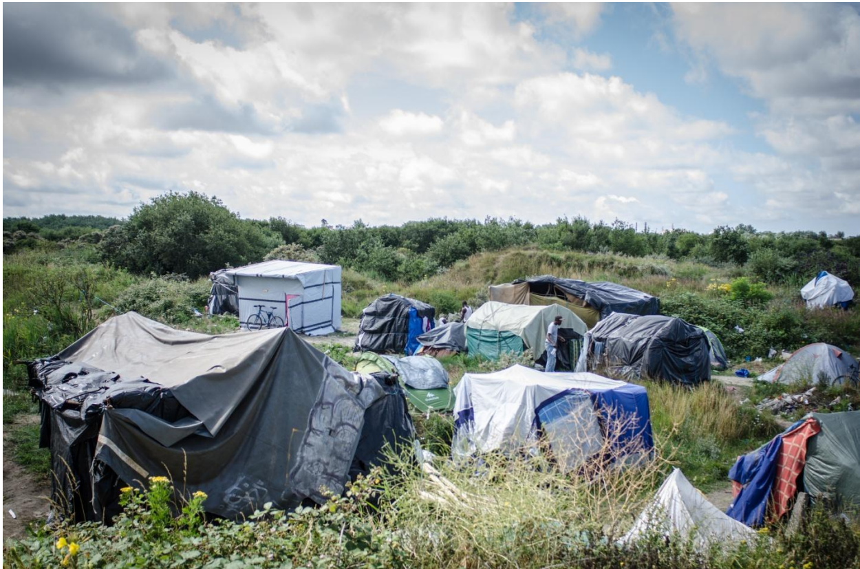
Figure 1: A view across part of the Calais camp showing the predominant type of improvised shelter.

conditions continued to harm migrant bodies and minds in often unseen ways, which this paper seeks to uncover.