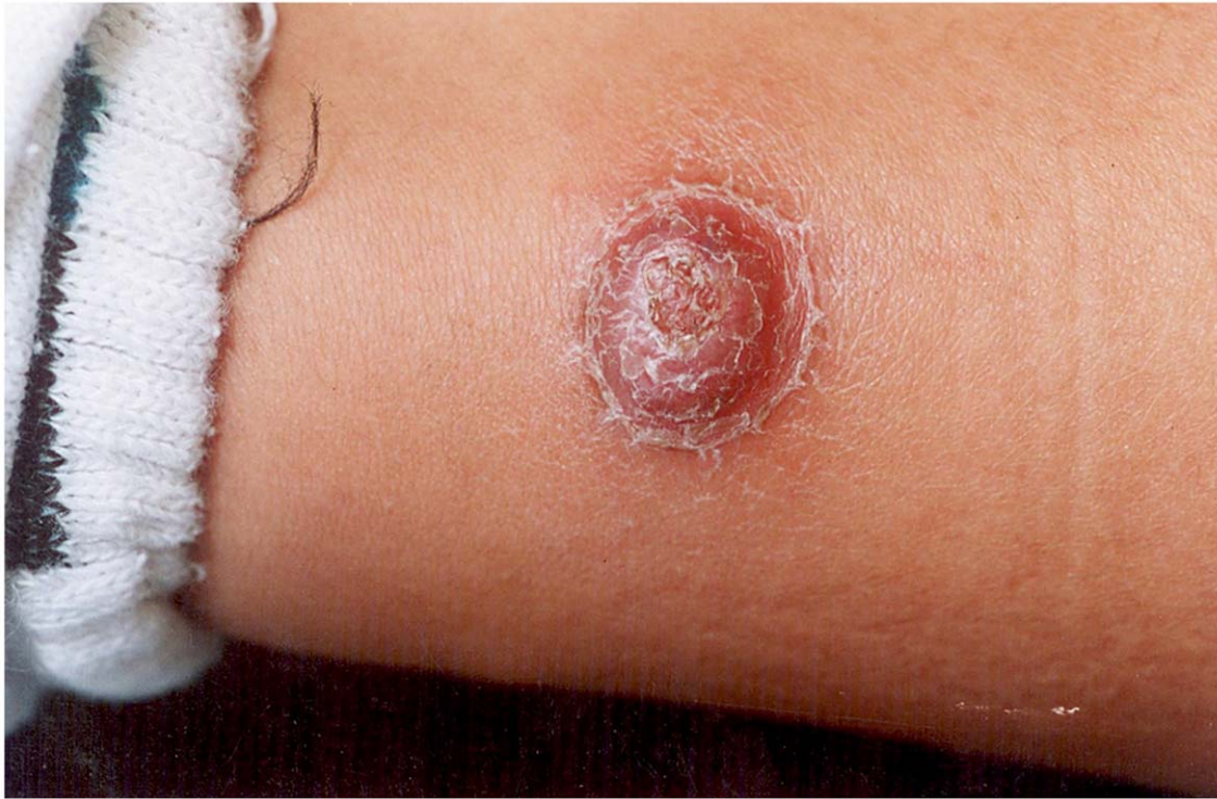
Figure 2. Malar lesion. doi:10.1371/journal.pntd.0001819.g002

thin smear positive, giving a sensitivity of 36%, and a positive predictive value of 44%. A specificity of 96% was obtained as 125 individuals were thin smear negative out of 130 PCR negative individuals.