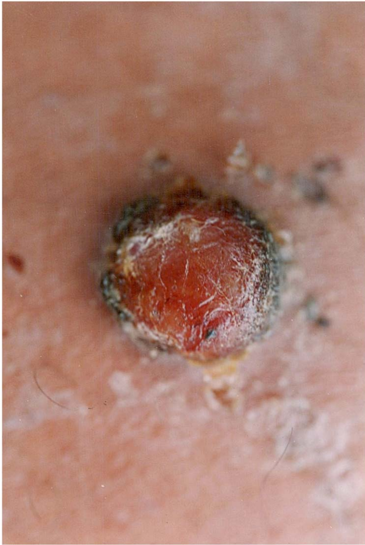
Figure 3. Mular lesion. doi:10.1371/journal.pntd.0001819.g003

for chronic disease leading to clinical cure in 93.1% of patients, though a large proportion (82%) required a prolonged treatment course of greater than 21 days.