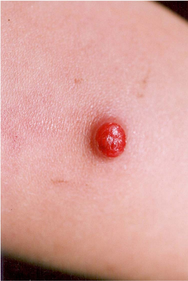
Figure 1. Miliary lesion. doi:10.1371/journal.pntd.0001819.g001

et al [19], tested 33 cases (blood culture or smear positive) and 101 controls and found a sensitivity of 85% and a specificity of 92%. Four patients infected with other pathogens were tested for cross-reactivity (two with syphilis, two with cat-scratch disease, caused by Bartonella henselae ) and one of each tested positive.