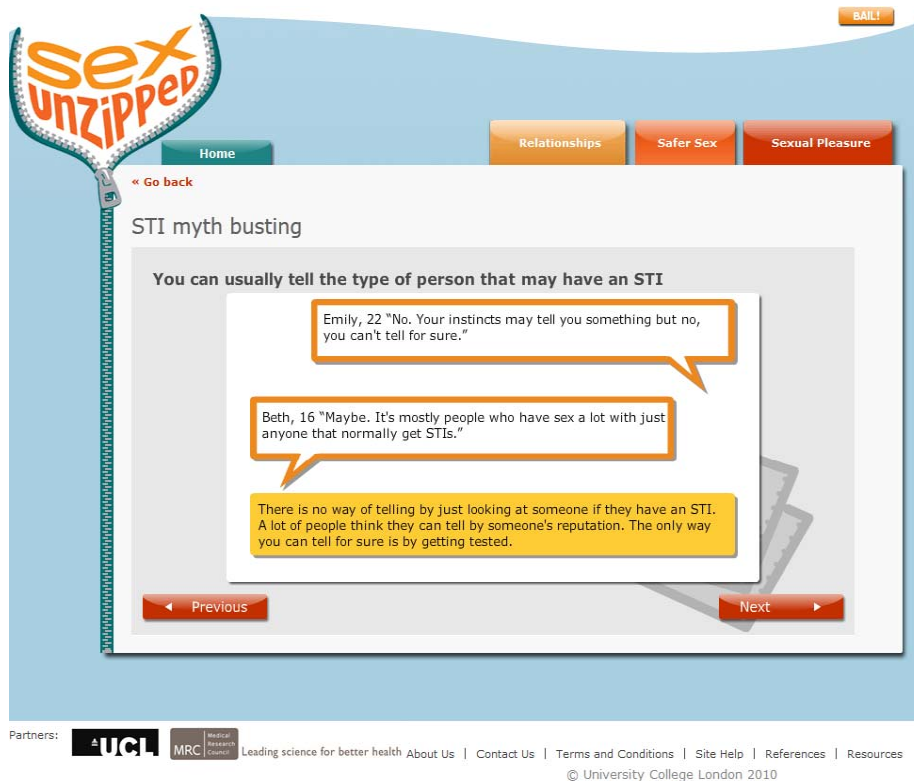
Figure 4. Example quotations.

The website also includes quotations with aliases reflecting a range of views intending to give the feel of a peer-to-peer exchange of views (Figure 4).