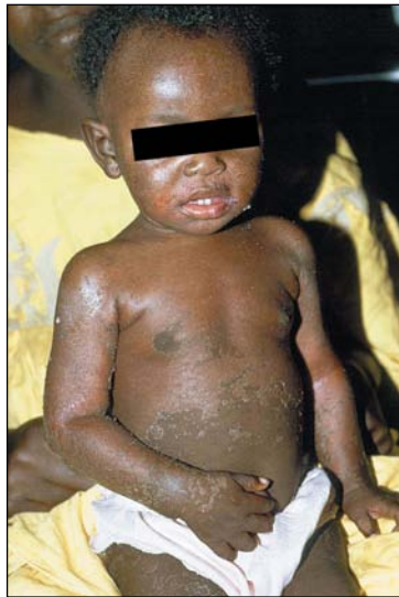
An African child with severe measles on day 10 of the disease.

By 2008, the WHO and partners were struggling with polio eradication, which had missed its 2000 global target. On scientific and public health grounds, the feasibility, desirability, and timing of measles eradication should not be dependent on the ongoing polio-eradication effort. In practice, however, the two efforts are inextricably linked. Because the same donors that fund polio-eradication programs will be called on to support measles eradication, the shifting of resources could jeopardize polio-eradication efforts. Some argue that if polio eradication is really feasible, it should be completed before measles-eradication efforts are launched; yet by 2008, continuing polio transmission in India, Nigeria, Pakistan, and other countries where the virus was endemic was leading to growing