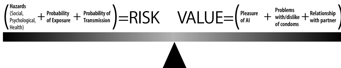
Figure 6.1: Factors influencing decisions to engage in UAI.

The magnitude of risk associated with UAI will depend on: the perceived threat to one's social stability or psychological and physical health; how likely it is that one's partner will be exposed to HIV and if so; the likelihood that he will become infected as a result. On the other hand, the value of UAI is influenced by how pleasurable anal intercourse is to both partners, whether or not either of them experiences difficulties using condoms or simply dislikes them as well as the relationship between both partners. For example, for some men, anal intercourse with a long term beloved partner is particularly valuable while for others anonymous anal intercourse is experienced as particularly exciting.