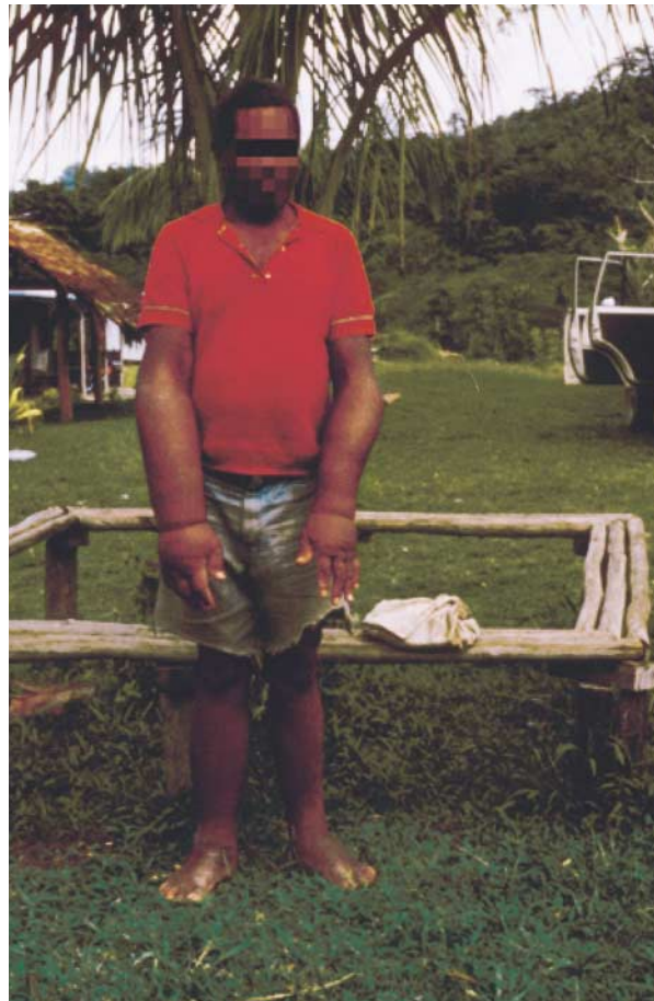
Figure 1. A 52-Year-Old Papua New Guinea Man with Elephantiasis of the Legs and Lymphedema of the Arms.

The frequency of adverse reactions according to the treatment regimen, differences in the proportion of subjects who were positive for microfilariae before and after each treatment, and changes in the antigen level and the severity of lymphatic abnormalities were evaluated for significance with the use of chi-square tests. Differences in the rates of transmission before and after treatment were evaluated with use of the Mann-Whitney U test. A generalized estimating equation was used to assess the difference in the odds of having a microfilariae-positive infection according to the treatment regimen and rate of transmission (moderate or high) after adjustment for the correlation of observations within treatment units over time. 22 The