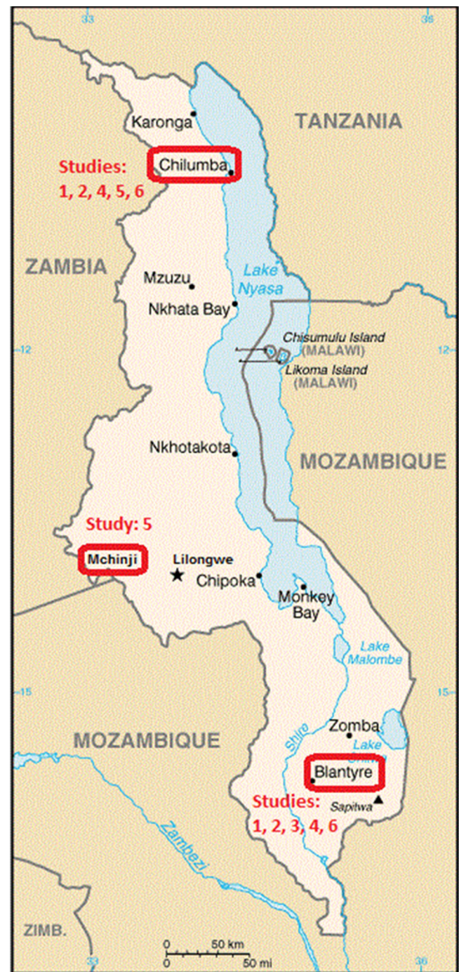
Fig. 1. Map of Malawi. Areas highlighted represent the three study sites. Studies by site: (1) Disease incidence and distributions of S. Pneumonia serotypes and rotavirus genotypes. (2) Matched case-control studies of direct PCV effectiveness against IPD and against radiological pneumonia using community controls. (3) Matched case-control study of indirect PCV effectiveness against IPD in adults living with vaccine age-eligible children. (4) Matched and unmatched case-control studies of RV1 effectiveness against severe acute rotavirus gastroenteritis using community controls and hospitalised rotavirus test-negative controls, respectively. (5) Population based cohort study to measure under-5 and post-neonatal infant all-cause and disease-specific mortality by vaccine status. (6) Cost-effectiveness studies from societal, healthcare provider and household perspectives.

Southern Malawi: The Malawi-Liverpool-Wellcome Trust Clinical Research Programme (MLW) in Blantyre has surveillance for IPD spanning 13 years [3,22], and has extensively characterised rotavirus molecular epidemiology in the pre-vaccine era [34,35]. Blantyre district numbered 1,001,984 persons at the 2008 census [32]. Queen Elizabeth Central Hospital (QECH) provides free health services and is the principal referral centre [36]. Active case finding at QECH paediatric emergency department and inpatient wards enrolls children with presumed sepsis, meningitis, acute gastroenteritis and severe respiratory illness, in whom blood culture, lumbar puncture, stool collection, chest radiography or nasopharyngeal swabs are performed per protocol. Blood culture is not