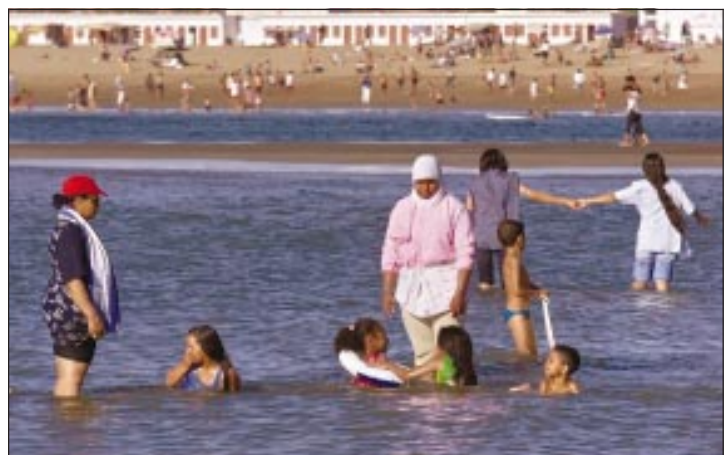
Moroccan women benefit from reproductive health programmes that have a large component of essential obstetric care

In the long term, sustaining affordable improvements in safe motherhood depends on improving the functioning of health systems as a whole. Gains made in countries such as Malaysia and Sri Lanka were achieved by making maternity care a priority that guided changes in health services. Efforts to achieve similar gains in other developing countries need pragmatic support. Sector-wide approaches and other