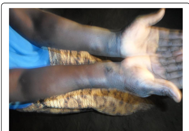
Fig. 3 Deformed hands of a recovered rHAT patient

Physical deformities were observed in several rHAT patients (Fig. 3) which tended to become permanent disabilities. In a personal interview with a female patient who was still in hospital and had physical disabilities, she mentioned that she believed the disability was associated with melarsoprol treatment. She further mentioned that the disability resulted in her loss of self-esteem. It was also established during focus group discussions that deformities had a strong social impact on women because of loss of self-