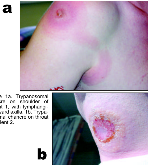
Figure 1a. Trypanosomal chancre on shoulder of patient 1, with lymphangitis toward axilla. 1b. Trypanosomal chancre on throat of patient 2.

Both patients were treated in accordance with a protocol developed and used in Malawi and Uganda by workers from the Liverpool School of Tropical Medicine. Intravenous suramin (reconstituted in sterile water to a 10% solution, with the required dose added to 200 mL 5% dextrose and infused over 2 hours) is administered at doses of 5, 10, and 20 mg/kg on days 1, 3, and 5, respectively (maximum 1.5 g/dose). Close observation is needed to detect signs of an idiosyncratic (anaphylactoid-type) reaction. Some authors recommend that a test dose of 100 to 200 mg of suramin be given before the first full dose, to exclude immediate hypersensitivity. Fresh CSF samples are examined on day 5 to determine whether there is evidence of central nervous system (CNS) involvement, as defined by elevated IgM, pleocytosis, or presence of trypomastigotes. Lumbar puncture is deliberately deferred until circulating trypanosomes have been cleared, to minimize the theoretical risk of iatrogenic introduction of trypomastigotes