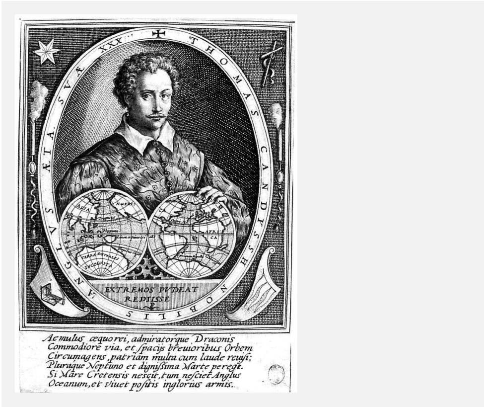
Fig. 2 Engraving by Crispin van de Passe from Effigies Regum ac Principum (1598). The legend from The Aeneid "EXTREMOS PUDEAT REDISSE" ("It would be shameful to return last of all") may be an allusion to Cavendish's refusal to return with dishonour or, alternatively, an attack on Davis, who did return last in June 1593 on the Desire (the Galleon had arrived in February of March).

http://www.geheugenvannederland.nl/nl/geheugen/view?coll=ngvn&identifier=BVB01%3ABDH19058PK.