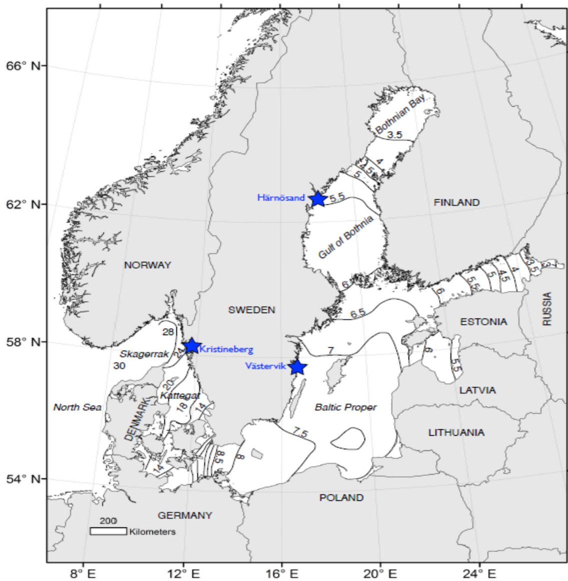
Figure 1. Sample localities and salinity-gradients in the North Atlantic – Baltic Sea region. Salinity data is from Leppäranta and Myrberg (2009).

This article is protected by copyright. All rights reserved.