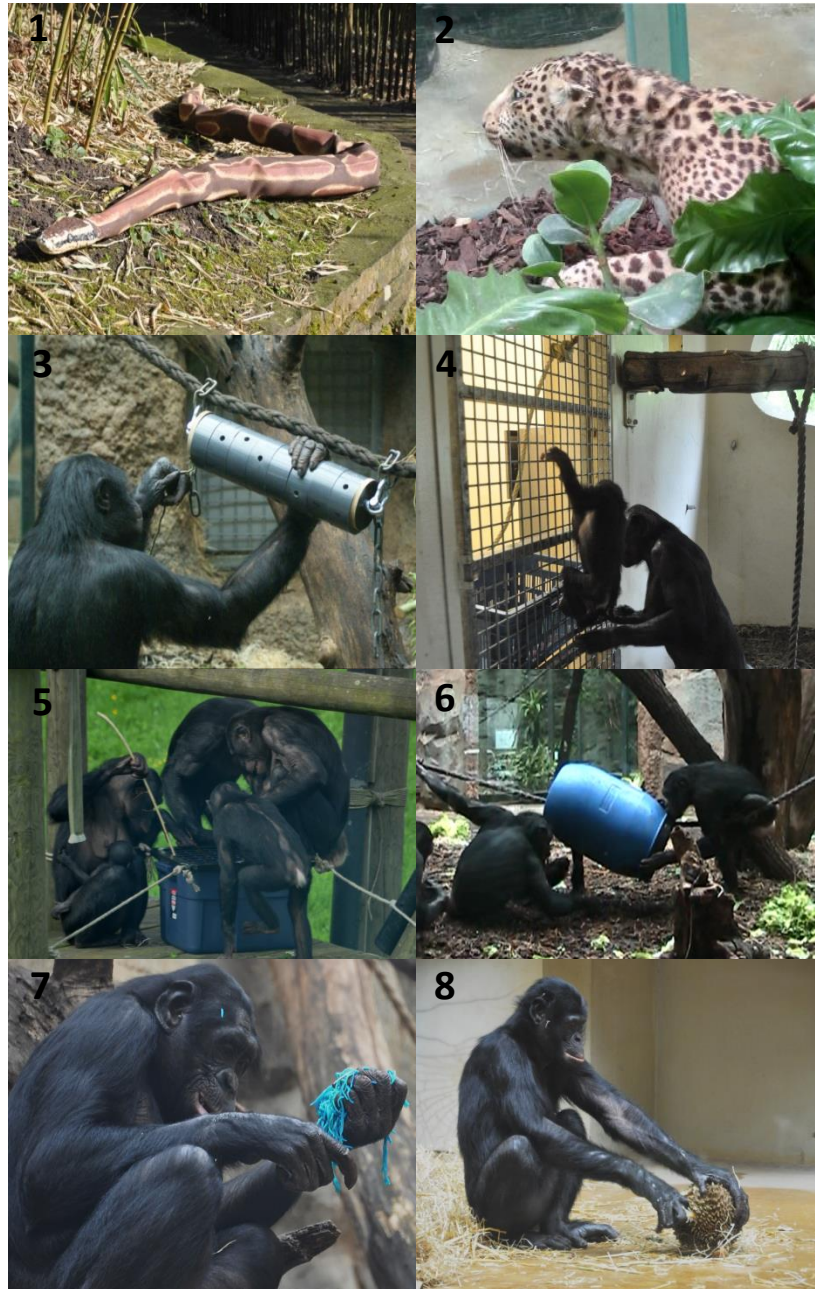
Figure 1. Behavioral variables from eight experiments were collected to assess their association with rated personality traits. Bonobos were tested in three different experimental contexts: Predator experiments included a fake python (1) and taxidermied leopard (2). Puzzle feeder experiments included turning tubes puzzle (3), reel and feed puzzle (4), Barrel with mesh puzzle (5) and hanging barrel puzzle (6). Novel food experiments included blue dyed pasta (7) and durian fruit (8).