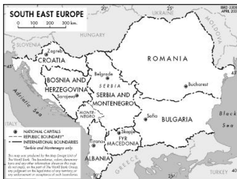
Figure 1. Map of south-east Europe