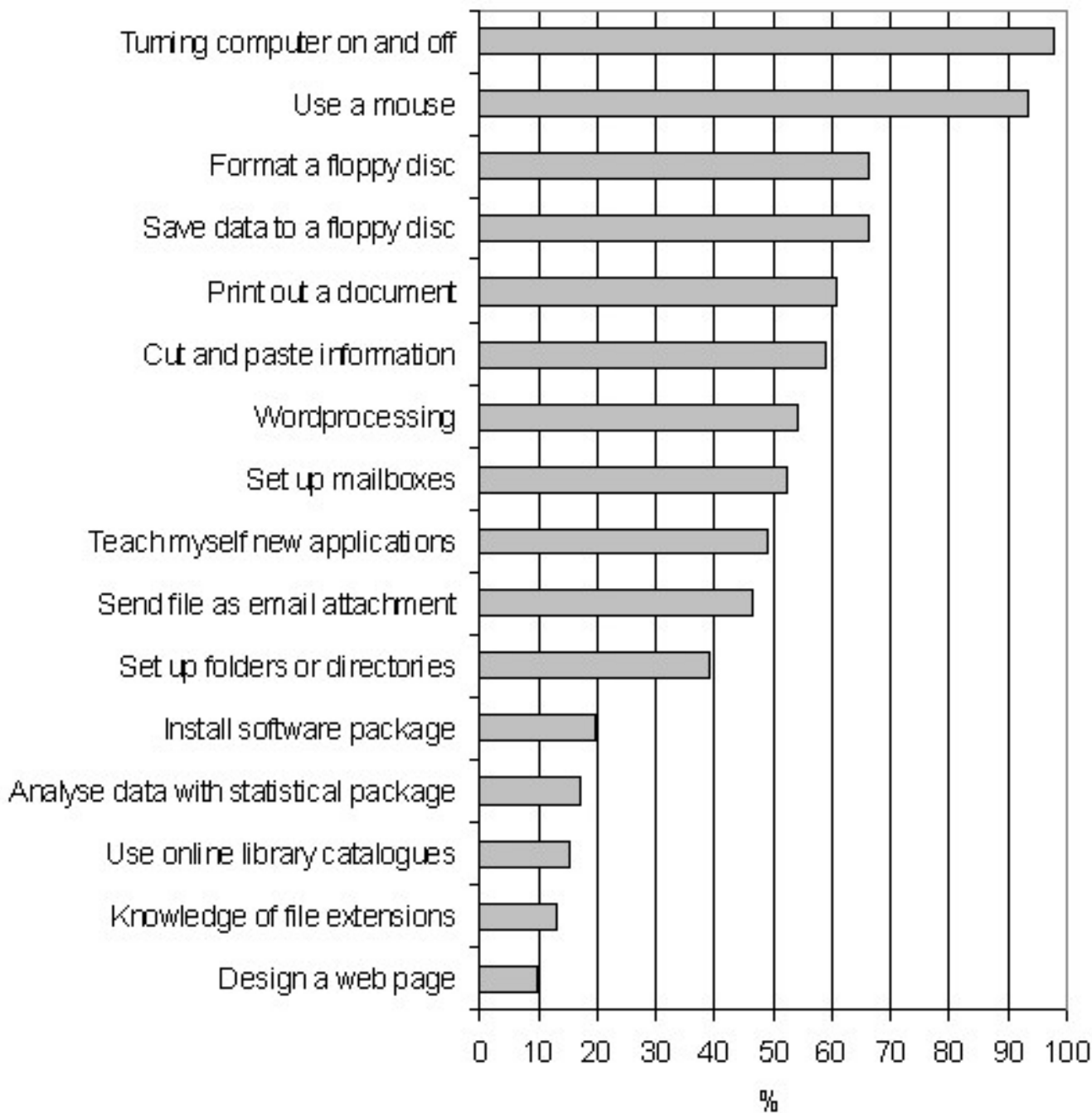
Figure 2 Specific ICT Skills of 92 Medical Students at Muhimbili University College of Health Sciences. The data are shown as percentages of students reporting to have the abilities to perform these tasks.

7.7(± 4.1) (out of a maximum score of 16) respectively. The two scores were significantly correlated, r = 0.81 , p < 0.001 .