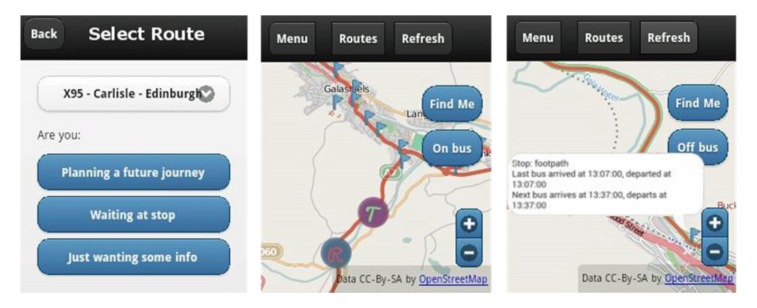
Figure 2 Screenshots of the final GetThereBus app: route selection (left); map based RTPI visualisation (centre); and accessing timetable information for a stop (right).

The registration page allows the user to sign up by providing a name, email address, and password. Following verification of the email address, the user can then log-in to the application. Once logged-in, the route selection page (Figure 2, left) prompts the user to select the service and direction of travel about which they wish to receive information. Once an option is selected, the user must indicate why they desire this information (planning a future journey, waiting at stop, or just wanting some information - a catch-all for other uses of the app) before viewing the map screen.