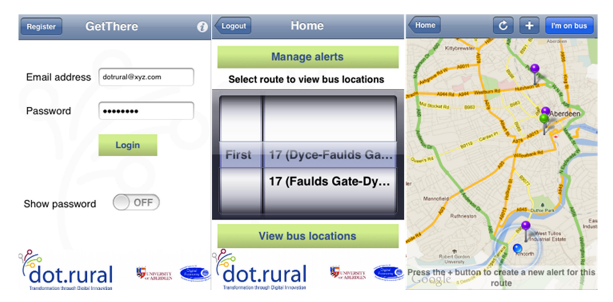
Figure 1 Screenshots of the initial version of GetThereBus; screens shown are: log in (left); route selection (centre); map based RTPI visualisation (right).

The main discussion points that emerged during the focus group related to: concerns regarding potential for incorrect/unintended use of the "I'm on bus" button and failing to deactivate at journey end; desire for display of additional travel information, such as bus stops and vehicle routes; preference for map- rather than text-based description of estimated time until arrival; concerns regarding data coverage in rural areas and downloading of map tiles (images); and desire for alternative methods of accessing information, such as SMS. The discussion also noted that GetThereBus would be useful in rural areas that have low frequency bus services and otherwise no available RTPI, and that the application would allow users to adapt travel plans when a bus is running early or late.