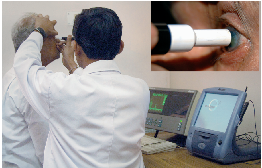
Figure 1. Photograph showing technique for applanation A-scan biometry

The measurement of axial length measurement has the greatest potential for error in calculating IOL power. Traditionally, contact A-scan ultrasonography is used. This