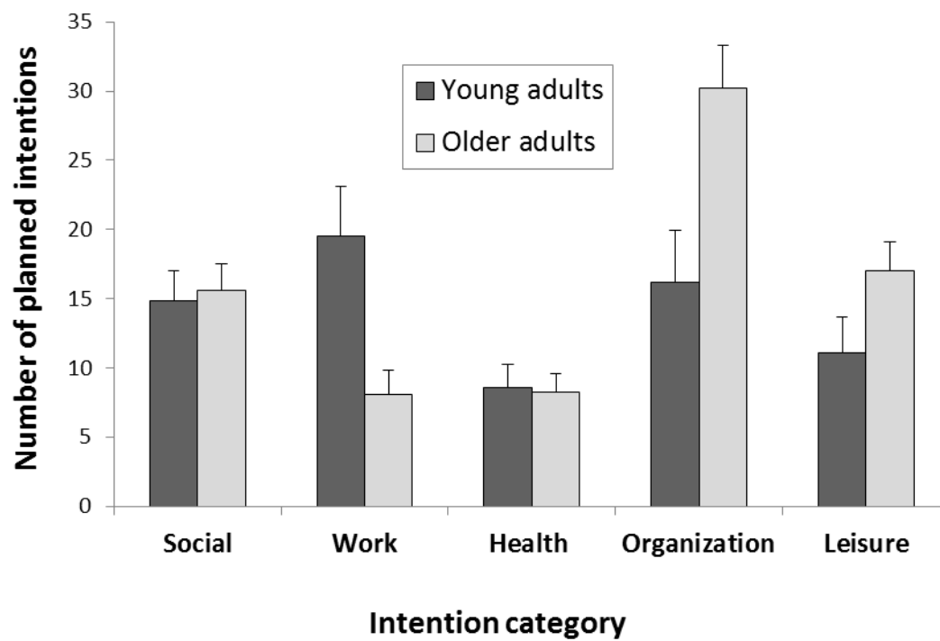
Figure 2. Number of planned intentions in each of the five categories in both age groups. Standard errors are represented in the figure by the error bars attached to each column.