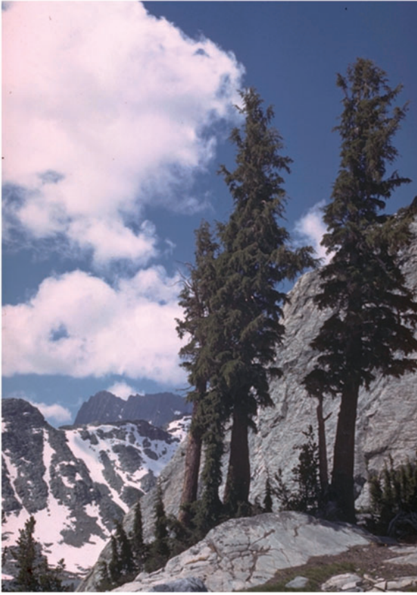
Fig. 2. ACC has driven an increase in precipitation in much of the more northerly latitudes (IPCC, 2014). This has, in turn, driven complex responses in wild plants. Mountain hemlock ( Tsuga mertensiana ) has shifted the centre of gravity of its distribution to lower elevations in California (a 255-m downwards elevational shift), in spite of an increase in mean annual temperature of 2.85 °C during the study period (1930s to 2000s). The observed downhill shift, while counter to expectations from warming, was in concert with a decline in water deficit of 134 mm over the past 70 years (Crimmins et al. , 2011).

these changes in distribution mirror changes in water availability, and so species were actually tracking geographic shifts in their climate niche over time, but that niche was driven mainly by water deficit rather than temperature (Fig. 2).