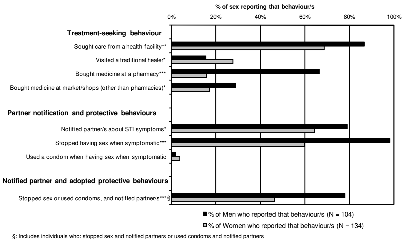
Figure 2 Treatment-seeking and partner notification/protection among symptomatic individuals, by sex of respondent. The 104 men and 134 women who reported genital discharge and/or ulceration in the past 12 months were asked if they adopted any of these behaviours when having STI symptoms; note that each respondent could report more than one behaviour. We also present the proportion that adopted a combination of appropriate behaviours – either stopping sexual intercourse or using a condom, plus notifying their partner regarding their symptoms. Items where the proportions differ significantly between genders are annotated (*** p < 0.001, ** p < 0.01, * p < 0.05).

women citing non-healthcare information sources was higher than for the men (17.8% in women vs 8.2% in men, see Table 3). None of the sociodemographic or behavioural factors (age, religion, educational level, time in refugee camp, marital status and age at first sexual intercourse) were found to be associated with better knowledge about STI symptoms in either men or women.