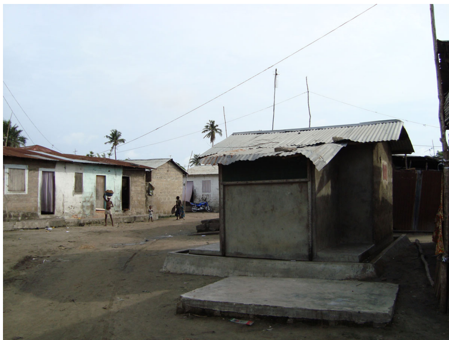
Figure 3 One of the experimental huts (on the right) used for the trial. These huts are located inside Ladji village and houses can be seen on the left

The bednets used were white 100 denier polyester netting (SiamDutch Mosquito Netting Co., Thailand) measuring 2.11 m length × 1.63 m width × 1.84 m high