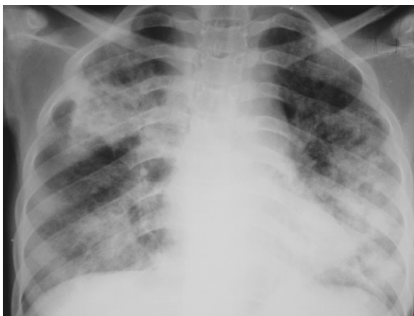
Figure 2 CR in a 14-year-old HIV-positive adolescent with predominant and patchy bilateral consolidation.

Hilar and/or mediastinal lymph node enlargement was seen in 7/29 patients with consolidation but in only 2/46 without consolidation ( p = 0.02 ). Similarly, hilar and/or mediastinal lymph node enlargement was identified in 9/42 patients with ring/tramline opacities and in none of the patients without ring/tramline opacities ( p < 0.005 ). There