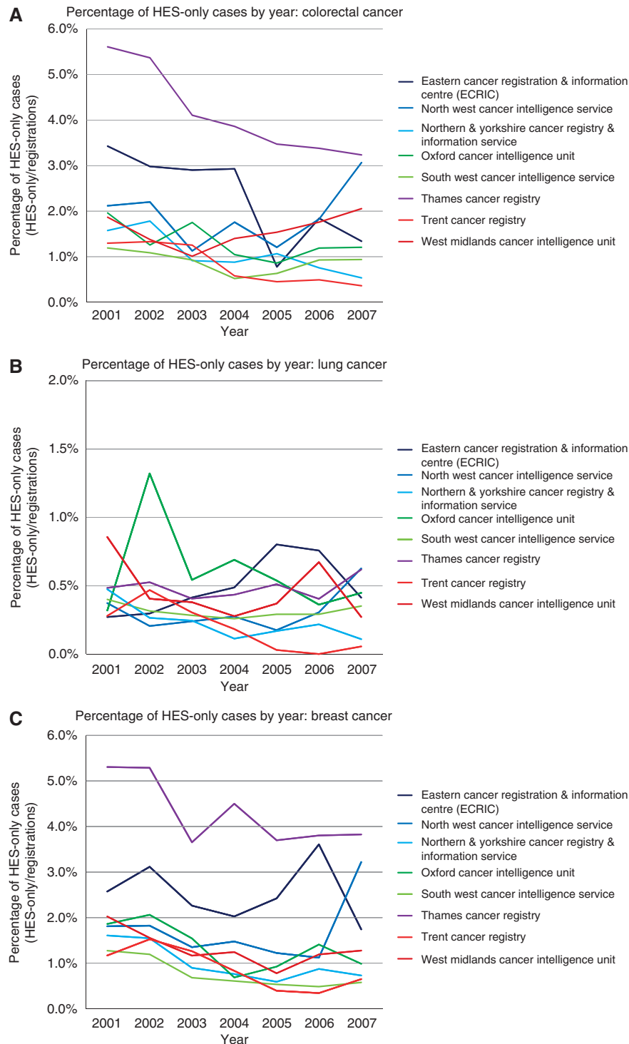
Figure 1 Percentage of HES-only cases in cancer registries in England, 2001–2007: (A) colorectal cancer, (B) lung cancer, and (C) breast cancer.

Finally, we evaluated the likely magnitude of the influence of incompleteness and survival time error on a commonly used outcome measure: the 1-year survival proportion. We computed