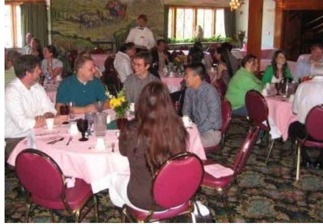
The master's students celebrate the completion of their program at an end-of-year banquet

Master's program. This year's incoming class is likely to be composed of nearly 50% students from outside the university. Over the past six years class sizes have ranged from 5 to 16 students, with an average of 10 students per year. Future plans include growth of the graduate program with the addition of a comprehensive exam option.