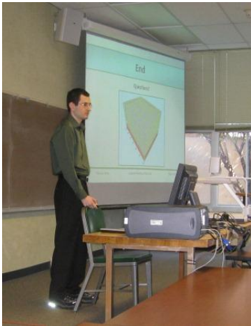
Master's students are required to formally brief progress on their project each quarter