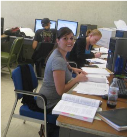
The master's graduate laboratory sponsored by Degenkolb Engineers includes computers with advanced software

The debate nevertheless continues on how to best use this situation to our competitive advantage. Should we double count even more units and make a master's program even more attractive? Should we attempt to create a five year experience where every student graduates with both an undergraduate degree and a master's degree, similar to the Architectural Engineering program at the University of Nebraska 3 ? Should we reduce the undergraduate program to 180 units, allow the undergraduates to depart sooner, and simply move more courses to the master's degree? The biggest argument against such a move is the perceived reduction of quality in the undergraduate degree which the industry partners who hire our graduates and our own students have come to value.