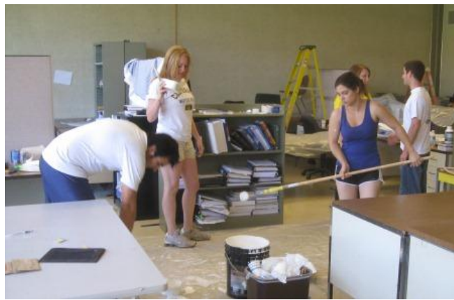
Each class of graduate students makes an improvement on the graduate lab for the benefit of those students who will follow.

Mandatory Unit Reduction – California has been struggling with a budget crisis in public education for the past several years. Over the past five years, the State budget has decreased by 44% and the rise in tuition has not covered the difference. 4 The California State University (CSU) is considering a mandate that all undergraduate programs be reduced to 180 quarter units (120 semester units). 5 As with similar mandates in Texas, Minnesota, and Maryland, there is a possibility that ABET accredited engineering programs will receive an exemption for 192 quarter units (128 semester units). 6,7,8 In either case, the master's program will be affected as moving existing undergraduate courses to the master's program is the easiest way to reduce units.