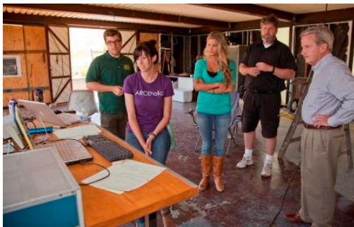
Graduate students support faculty members in their research

The department faculty is uniformly opposed to running a master’s program through self-support because the students have to pay more. They also fear that after jumping through the administrative hoops for self-support, the department budget will be reduced by whatever savings are gained. There has also been concern that the current budget model is unsustainable and will have to change at some point. When a more rational budgeting model is adopted, the financial benefit for continuing education may no longer be justified. The self-support system is really designed to provide on-line instruction to people outside campus for a profit and does not currently fit well with a traditional on campus program taught in conventional classrooms. There have been master’s programs that have creatively developed on-line certificates that can be combined with on campus classroom instruction to constitute a degree. Developing on-line instruction that might appeal to those in industry as well as the master’s program is something to consider for the future.