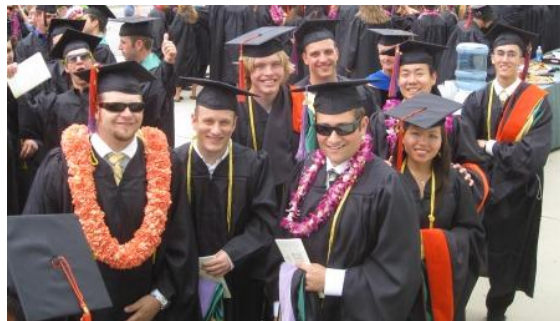
Master’s students celebrate their graduation.