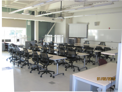
Photograph 2 Lecture Space

Lecture Areas: Each of the three class rooms has a central area for lectures surrounded by the team work areas previously described. The lecture area consists of tables and chairs for 24 students (see Photograph 2). These lecture areas allow the faculty to comfortably instruct the 24 interdisciplinary students in each specific class room. These three lecture areas also allow students from each of the three disciplines to be separated for discipline specific instruction. In addition to faculty lectures, this lecture area is also used by student teams for in-progress project presentations to faculty and student peers.