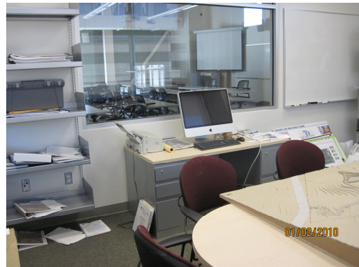
Photograph 3 Faculty Ready Room

Lecture Hall: There are frequently times when instruction for the entire cohort of 72 students in all three class rooms is desirable. The class room spaces, which are comfortable for instruction of 24 students, are totally inadequate for instruction of the entire group of 72 students. This has required significant logistical effort to locate and reserve larger spaces on campus for instruction of all the students. In addition, moving to a larger class room on certain days inevitably results in some missed communication despite best efforts by the faculty.