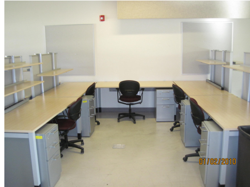
Photograph 1 Team Work Station

To support this landmark endeavor, three adjacent classrooms have been dedicated to the course in the new CM building at Cal Poly. While many features of the new rooms have worked very well, there have already been lessons learned that could significantly improve the functionality of the class rooms. These three classrooms have team work areas, lecture area and faculty work areas.