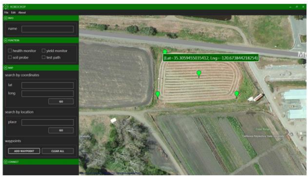
Figure 2. Ground robot control user interface

(2) A user interface has been developed using C#. The user interface can be used to plan missions, display robot parameters, sensor data collected. The user interface screen shot is shown in Figure 2.