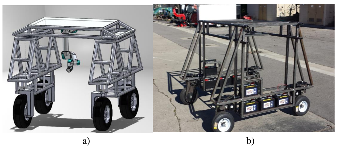
Figure 1. a) SolidWorks design b) actual robot

(2) A user interface has been developed using C#. The user interface can be used to plan missions, display robot parameters, sensor data collected. The user interface screen shot is shown in Figure 2.