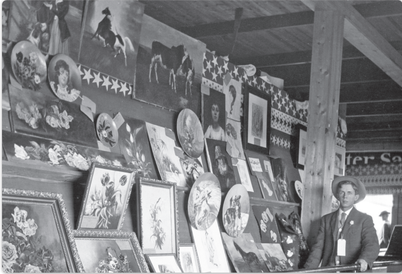
Painting Exhibit Franklin County Fair, Sheldon, Vermont. Note the sign in the background that appears to say Butter Salt.

market for butter was growing, there was also competition from other areas of the state, other states in the northeast, and from states in the west as well. Furthermore, beginning in 1873, there was also competition from artificial butter, or oleomargarine.