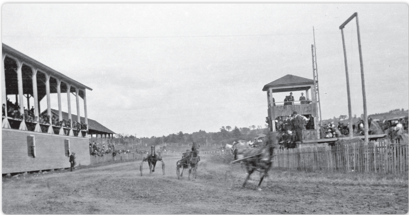
Horse Racing, Franklin County Fair, Sheldon, Vermont.