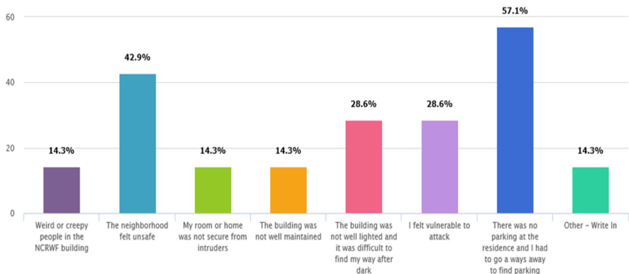
Figure 2. Primary reasons why you felt less safe in a vacation rental, compared to a hotel/motel

A final question asked if the availability of a VR had any influence on their attending the festival. Figure 3 illustrates that a total of 43.9% indicated that VR availability had no influence on their attending the event. But 31.6% agreed if a VR had not been available in their price range it would have decreased their likelihood of attending the event. 24.6% agreed that since a VR was available in their price range it increased their likelihood of attending the event.