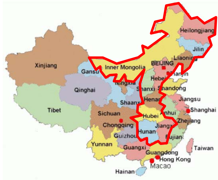
Figure 2: Coverage of Panel Data Sample

The majority of the sample power plants are very small low-parameter power plants with an installed capacity less than 50MW. For calculation simplicity, when the provincial aggregated data of these small inefficient power plants is available, the aggregated data is used as a large DMU in the model. Two reasons support the use of this aggregated data. Firstly, because DEA is an extreme point method, these small and inefficient power plants can never affect the position of the production frontier. So the use of aggregated data does not have any active influence on the final performance measurement. Secondly, in general the majority of small power plants have been controlled by their owners less effectively than the big power plants 3 . Using aggregated data can therefore help to eliminate some sampling errors.