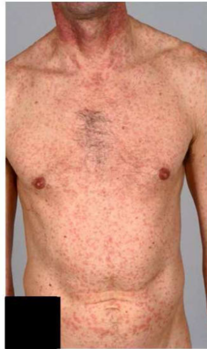
Nevirapine-associated rash – Day 10