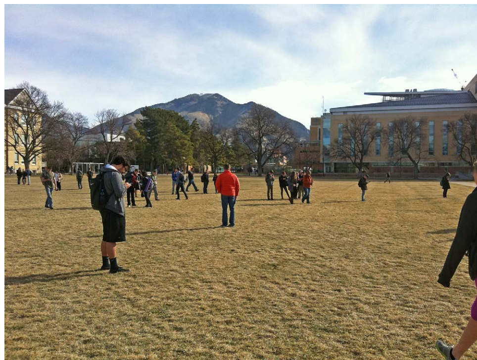
Figure 2. Nearly 100 physical geology students, working individually or in groups, play through “Grand Canyon Expedition: Geologic Structures” during class time on their campus quad.