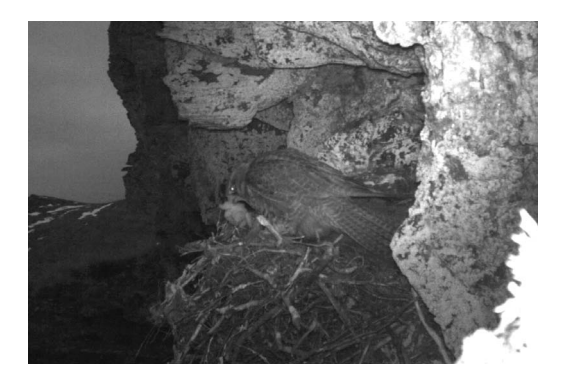
FIG. 2. Photo taken 1 June 2014 at 04:10 AKDT by a Reconyx PC 800 motion-activated camera. The photo shows a Gyrfalcon ( Falco rusticolus ) nestling held in the adult's beak. This illustrates the moment the adult moved the nestling to a new location following partial nest collapse. The location of the new nest site is outside the view of the camera.